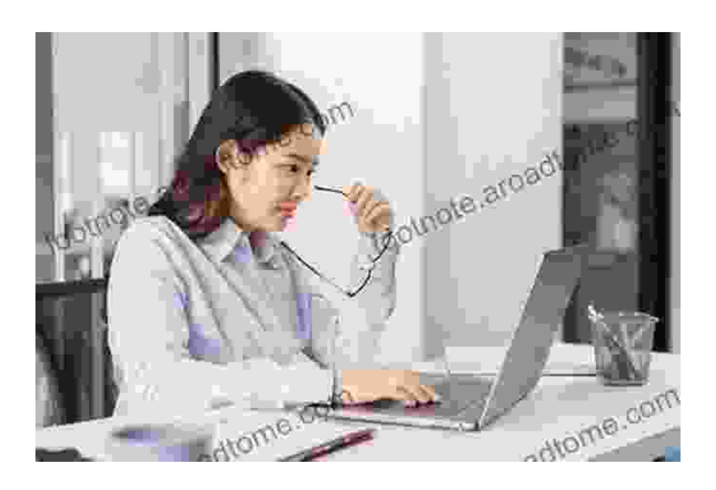
Chapter 2: Uncovering Hidden Gems: Researching and Selecting a Franchise

Chapter 2 guides readers through the meticulous process of researching and selecting a franchise. They will learn how to identify profitable industries, scrutinize franchise disclosure documents (FDDs), and conduct